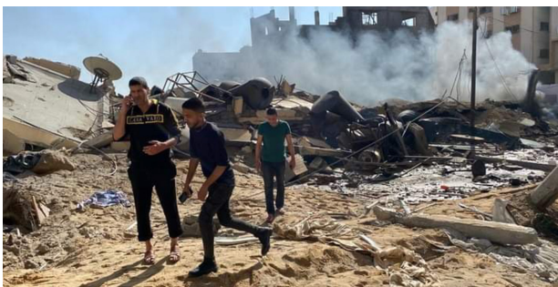
Gaza crisis, May 2021.

Aljazeera reported that on 15 May 2021 its journalists, hosted in the Al-Jalaa tower with journalists from the Associated Press and 60 residential apartments, received a phone call telling them that they had one hour to get to safety before Israel would launch airstrikes at it. The building was thereafter levelled to the ground, displacing all of its residents.