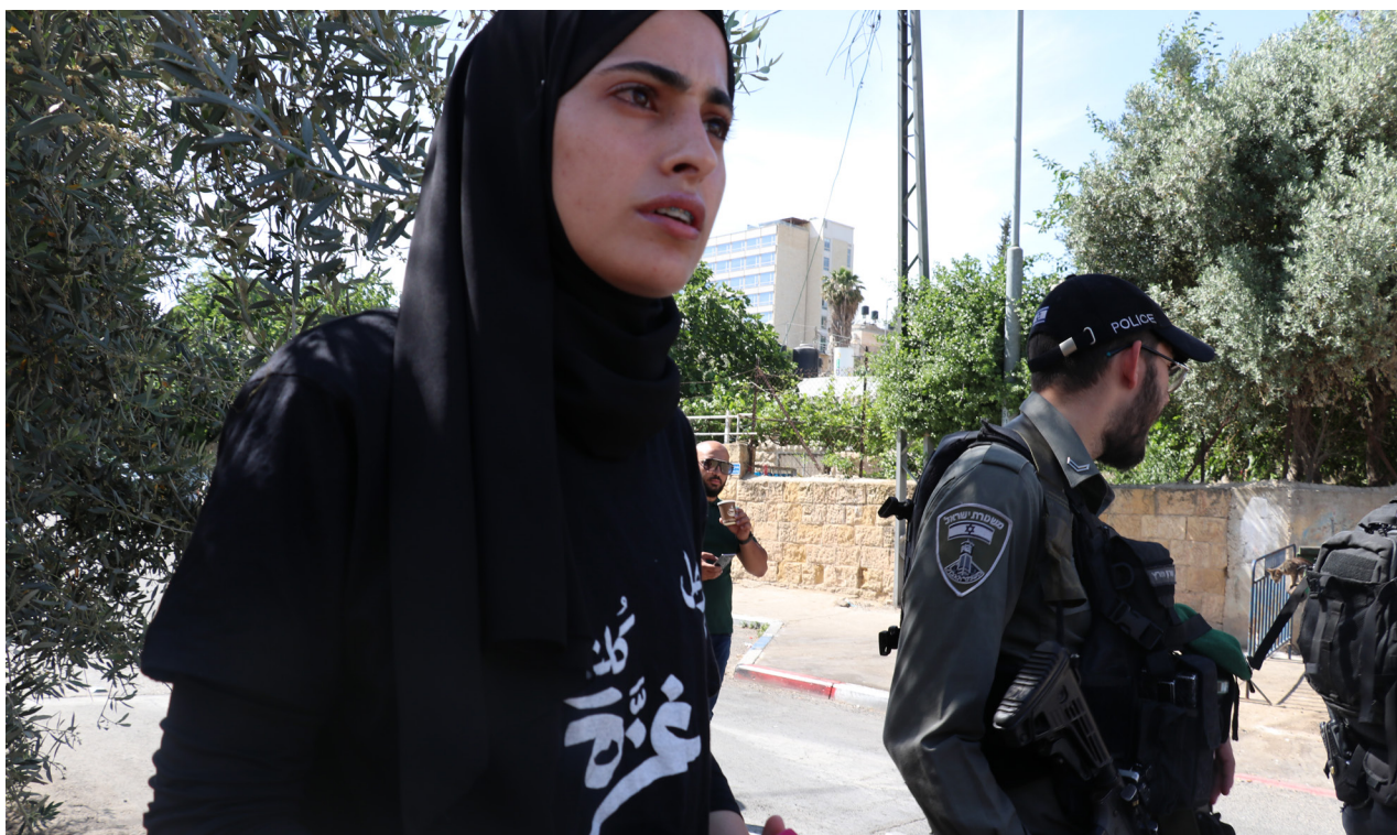
Muna - Palestinian Youth in Jerusalem to Use Social Media and Music to face Forcible Eviction.

Under international humanitarian law, a territory is occupied when it is placed under the authority of a hostile army. 31 The international community, the UN Security Council, and the UN General Assembly, all consider that Israel occupies the West Bank, including East Jerusalem, and the Gaza Strip since 1967. Notably, UN Security Council Resolution 242 from 1967 called for the “Withdrawal of Israel armed forces from territories occupied in the recent conflict”. 32