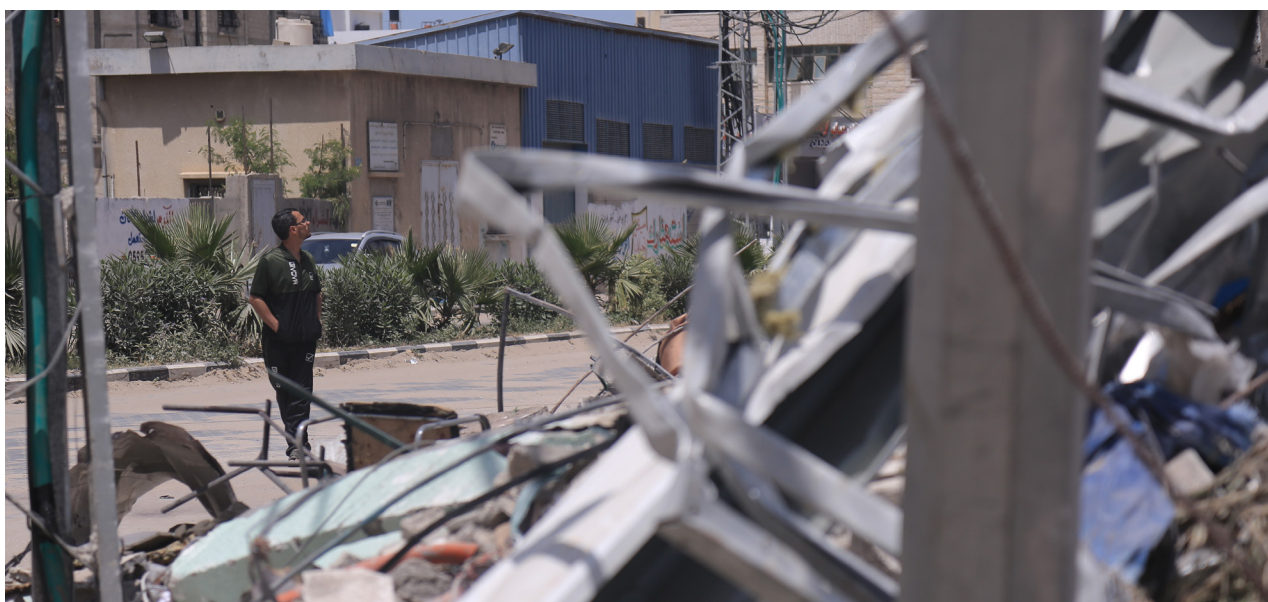
6 Destruction following Israeli attacks on the Gaza Strip, May 2021.

As is explained in Part IV of this Briefing Paper, Israel's practices and policies towards Palestine and Palestinians – such as the closure of the Gaza Strip, the establishment and expansion of settlements in the occupied territory, the denial of Palestinian freedom of movement, and the malicious and forced grouping of Palestinians – have had severe socio-economic consequences for the Palestinian population, de-developed the territory, and disenfranchised the people of their protections and rights.