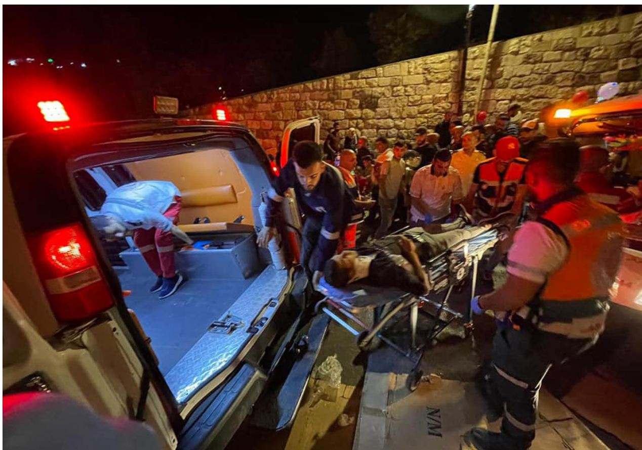
Clashes at the Al Aqsa Mosque, 10 May 2021.

Israel has occupied the Palestinian territory for over fifty years. During that time, Israel has sought to achieve a minimum number of Palestinians and an ever-expanding Israeli Jewish majority population over the same territory, thereby entrenching Israel's control over oPt and de facto annexing it. 55 A complex myriad of practices and policies that violate international law have been employed to this end. This part will only highlight some of these practices and policies. Many of the practices and policies are connected, and form patterns of illegal conduct. This Briefing Paper does not allow for an in-depth, layered analysis.