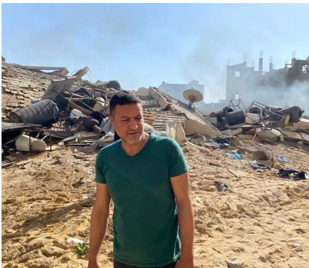
Gaza crisis, May 2021.

Since 2009, the OCHA has recorded the destruction of nearly 8,000 structures, displacing 12,000 Palestinians and affecting almost 130,000 persons in the West Bank. More than 1,400 of those structures have been donor-funded. 127 According to OCHA, the Israeli Civil Administration has issued more than 14,000 demolition orders against Palestinian-owned structures in Area C since the start of the occupation because Israel did not issue building permits for their construction. 128