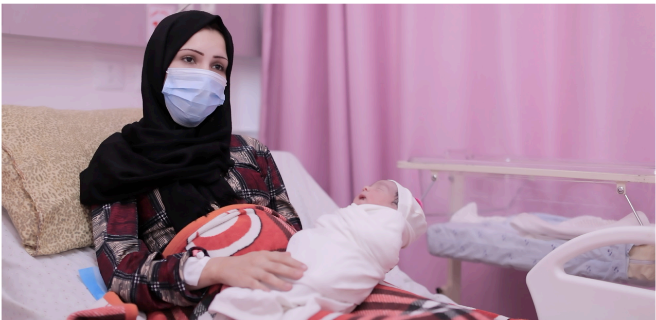
Fear and anxiety after latest attacks leave new mothers in Gaza unable to breastfeed and bond with their babies.

The UN Special Rapporteur on Violence against Women has highlighted that internally displaced women, in particular the Bedouin, are particularly vulnerable to sexual and gender-based violence. For example, in the case of the Bedouin women from the Jahalin tribe, the women have been physically cut from employment prospects through the erection of the Annexation Wall, leaving them few options to support themselves. Women who are excluded from the job market are more likely to marry and women who suffer from domestic violence are less likely to report the abuse if they risk losing their income. 136 The same Special Rapporteur found that women and girls living in refugee camps are at risk of particular forms of violence that result from their confinement to the household. 137