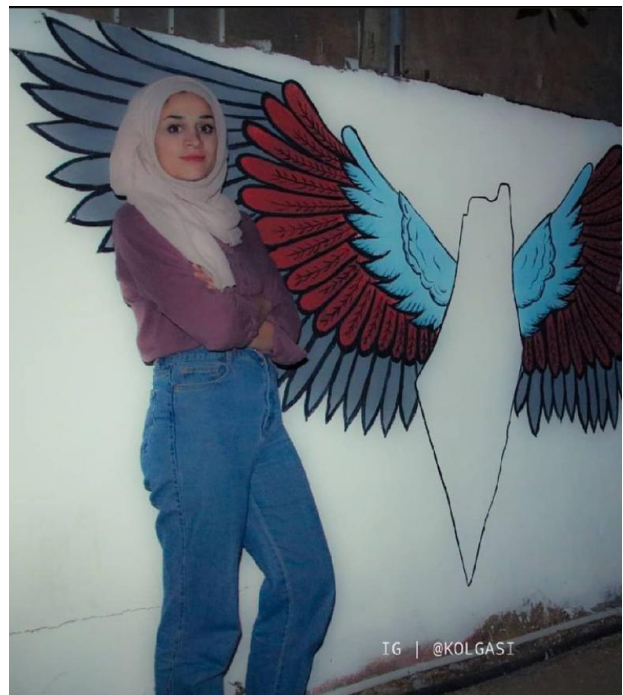
Young Palestinians living in East Jerusalem are harnessing the power of social media and music to tell the world about their fears of forced eviction and what life is like living under Israeli occupation.

Several members of the Palestinian Legislative Council have been placed under administrative detention, which is detention without a charge for potentially indefinite periods, in a concerted campaign since 2006. Unlawful association is a crime that Israel applies to all major Palestinian political parties and several non-governmental and charitable organizations. 82 These members are elected by the Palestinians people and, like Khalida Jarrar, were not accused of a violent crime. Khalida Jarrar is an elected member of the Popular Front for the Liberation of Palestine and she was placed under administrative detention between July 2017 and February 2019 based on “secret information” that is not disclosed. She was re-arrested in 2019 and sentenced to two years imprisonment for assuming a function within an Israeli-prohibited organization. The indictment clarified that she has no ties to any military, organizational or financial work. 83 Israel refused to allow Khalida Jarrar from attending the funeral of her daughter Suha Jarrar in July 2021. 84