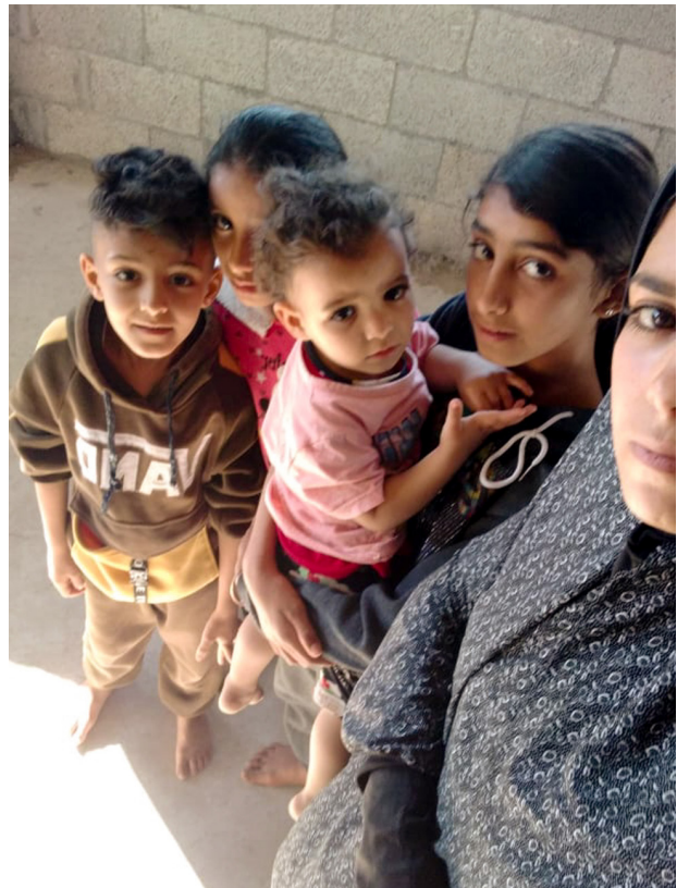
Gaza crisis, May 2021.

Israel's treatment of Palestinian natural resources, for the benefit of its own economy and nationals, obstructs the development of the Palestinian economy. The UNCTAD estimated in 2019 that Israel, in preventing Palestinian development of its oil and natural gas reserves in the West Bank and Gaza Strip, has caused accumulated losses in the billions of dollars for Palestine. 183