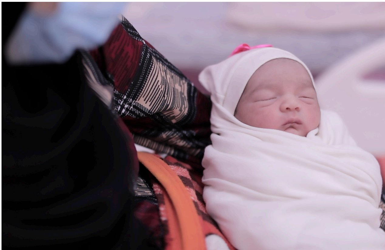
Fear and anxiety after latest attacks leave new mothers in Gaza unable to breastfeed and bond with their babies.