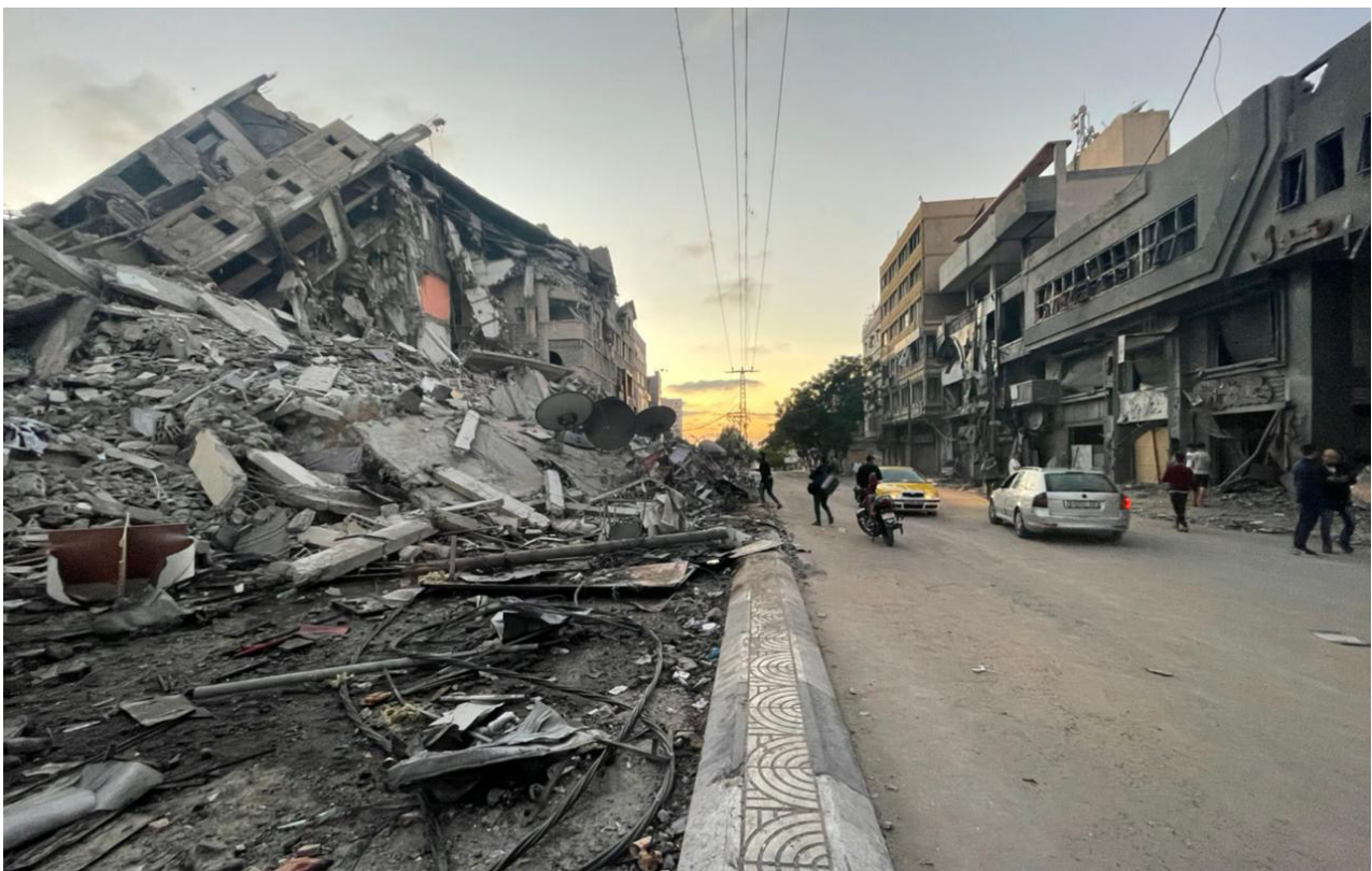
Large-scale destruction in Gaza following continued bombardment.

Sections IV.5 and IV.6 provide data on the injury and killing of Palestinians and the destruction of Palestinian structures in May 2021. Those sections also highlight the impact of the violence on women and children.